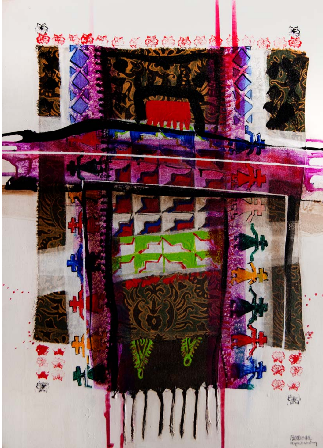
'Carpets2' 070X050 cm. acrylic, oil, gouache & fabric mounted on canvas, 2016