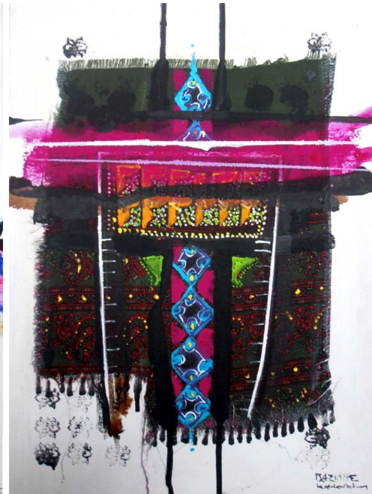
'Carpets2' 040X030 cm. acrylic, oil, ink, gouache & fabric mounted on canvas, 2016 'Carpets2' 040X030 cm. acrylic, oil, ink, gouache & fabric mounted on canvas, 2016 'Carpets2' 040X030 cm. acrylic, oil, ink, gouache & fabric mounted on canvas, 2016