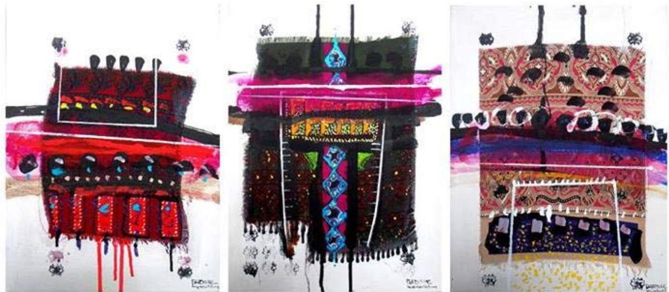
Vassilis Karakatsanis 'Carpets 2' 040X030cm. acrylic, gouache, ink & oil on fabric, mounted on canvas, 2016 (each)