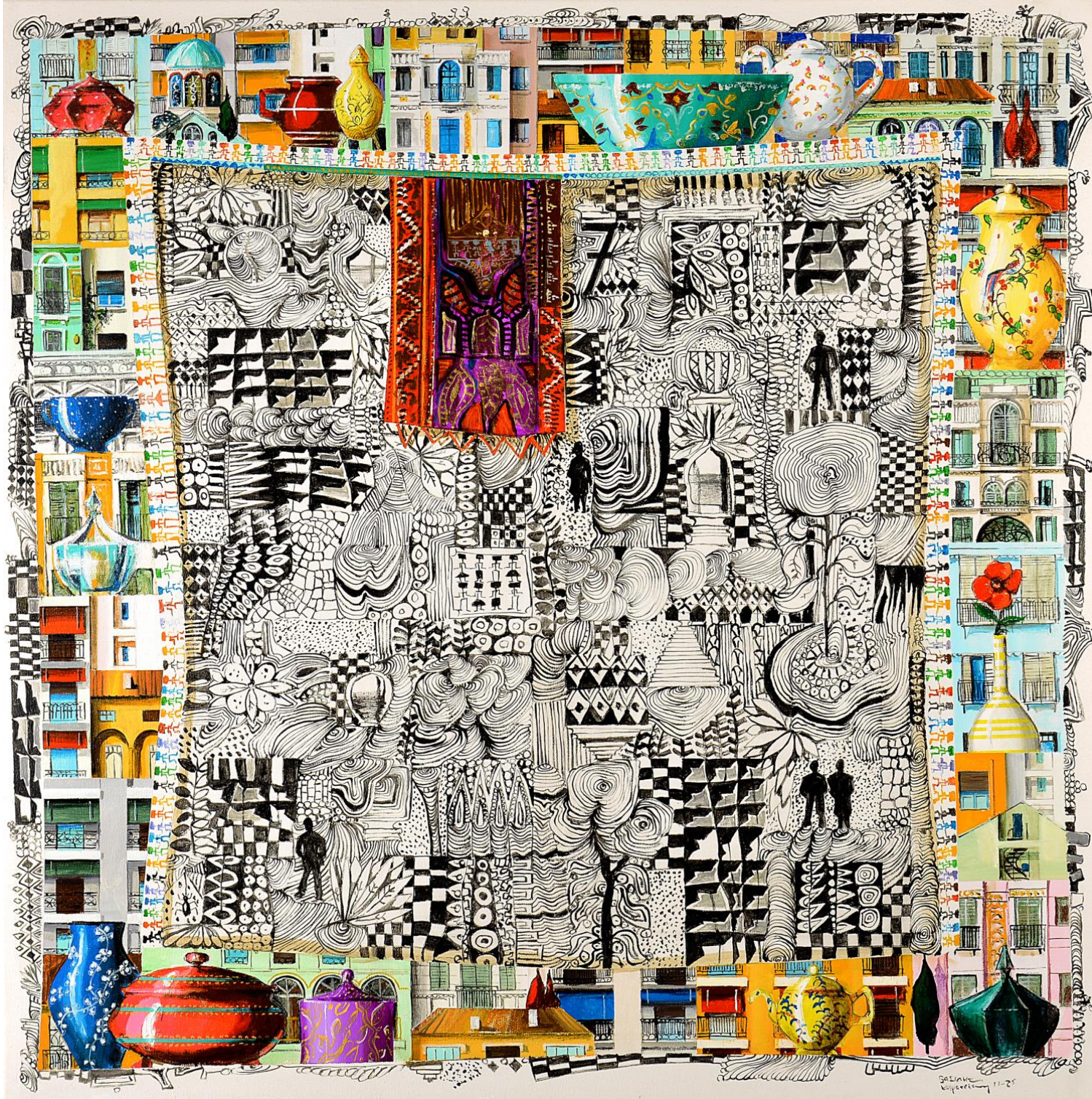
'Urban Tools II-No13-the oath' 2025, 100X100cm. acrylic & oil on canvas