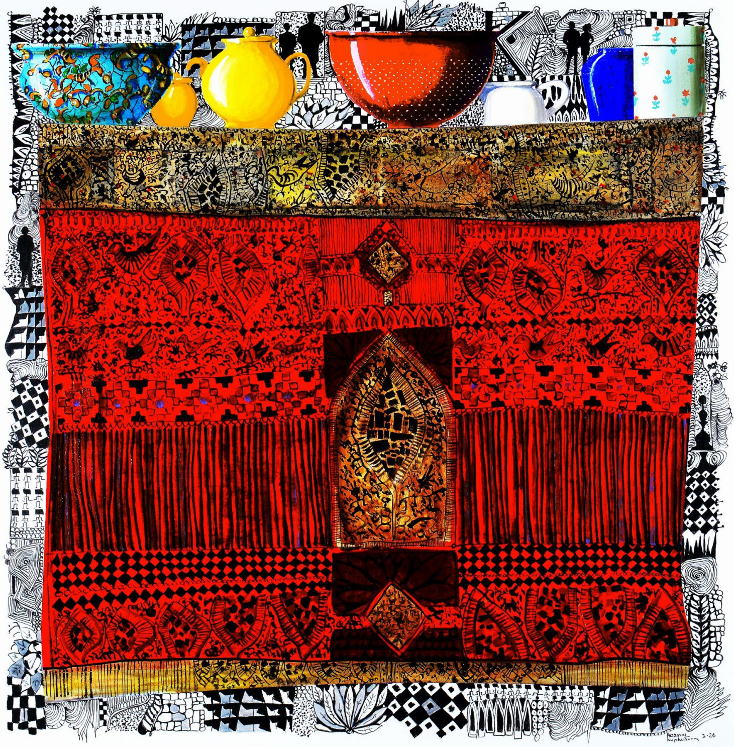
'Urban Tools II-No24-the yellow teapot' 2026, 100X100cm. acrylic, gouache & oil on canvas