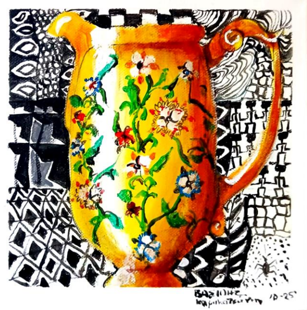
'Urban Tools II-No4' 2025, 20X20cm. acrylic, on canvas, private collection, Thessaloniki, Greece