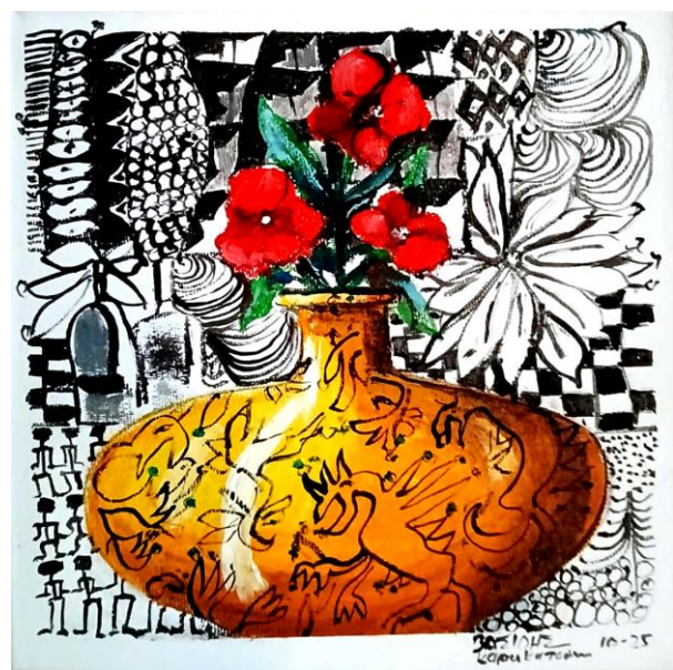
'Urban Tools II-No1' 2025, 20X20cm. acrylic, on canvas, private collection, Athens, Greece