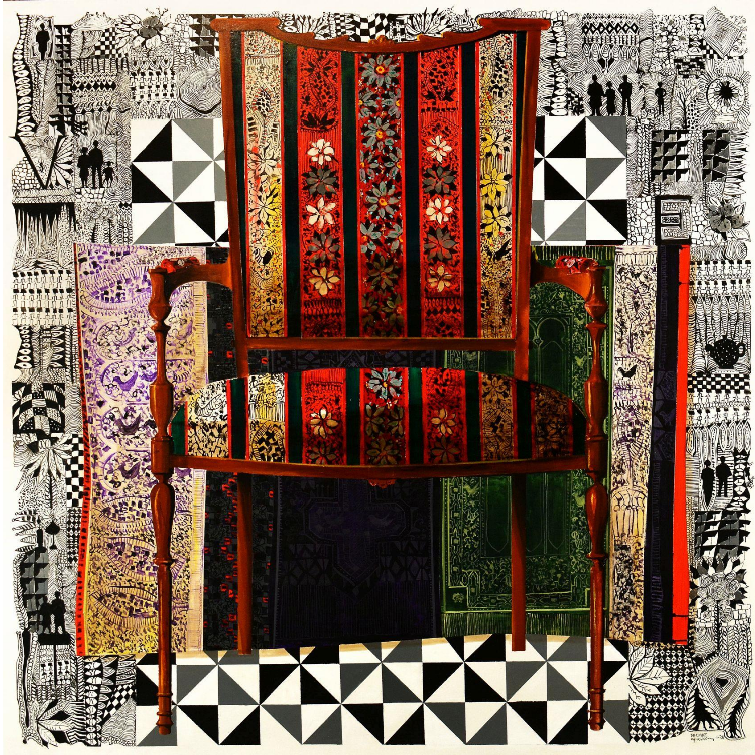
'Urban Tools II-No22-patisserie Zavoriti' 2026, 140X140cm. acrylic, gouache & oil on canvas