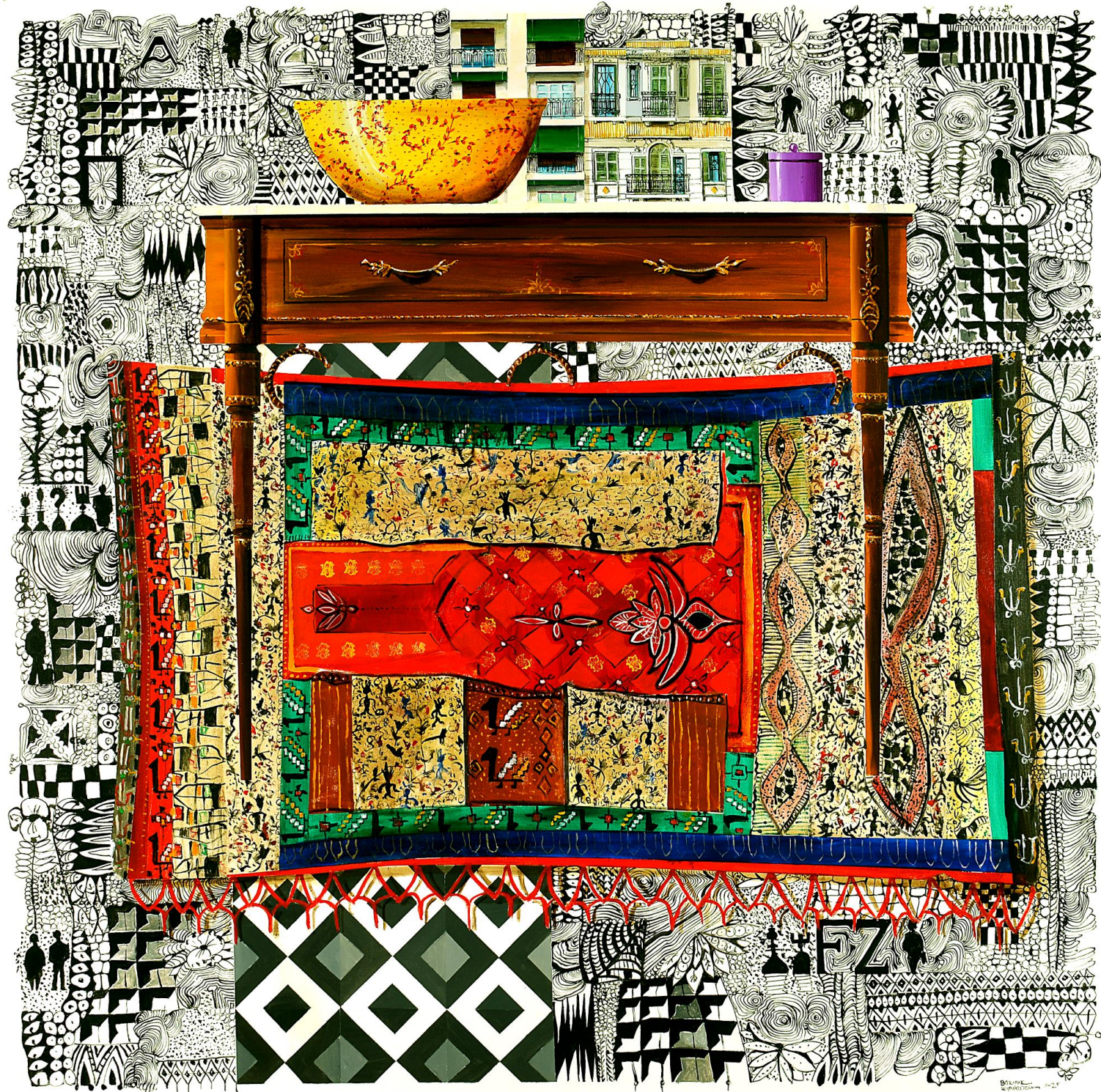
'Urban Tools II-No14-the little powder box' 2025, 140X140cm. acrylic & oil on canvas