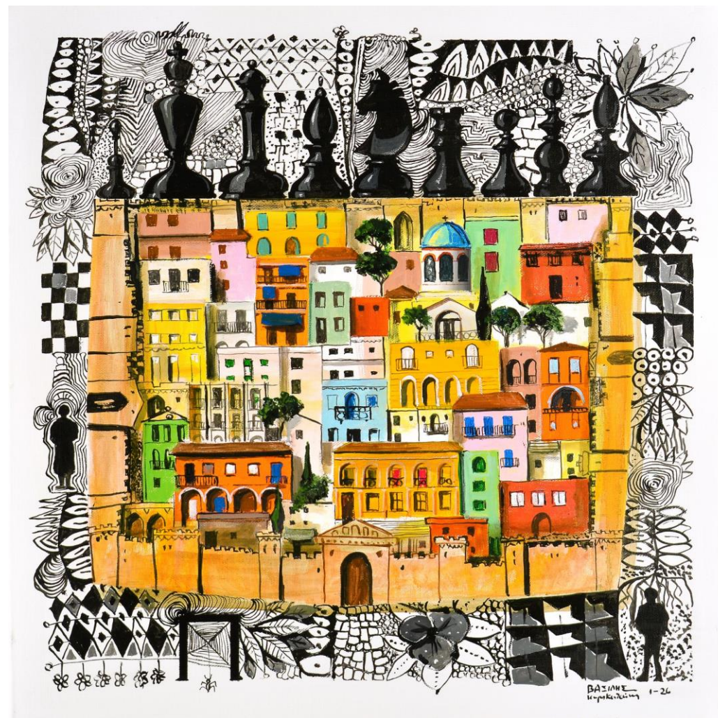
'Urban Tools II-No20-the dragon jars' 2026, 50X50cm. acrylic, gouache & oil on canvas 'Urban Tools II-No21-the city guard' 2026, 50X50cm. acrylic, gouache & oil on canvas, private collection, Thessaloniki, Greece