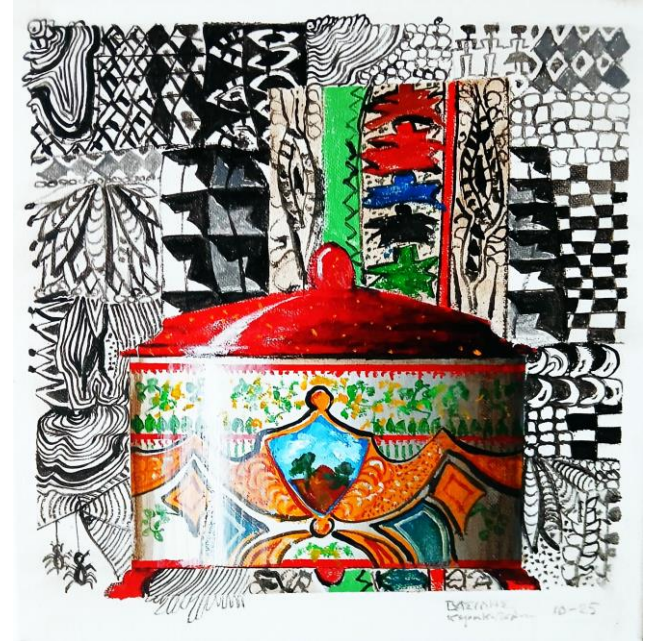
'Urban Tools II-No7' 2025, 30X30cm. acrylic, on canvas