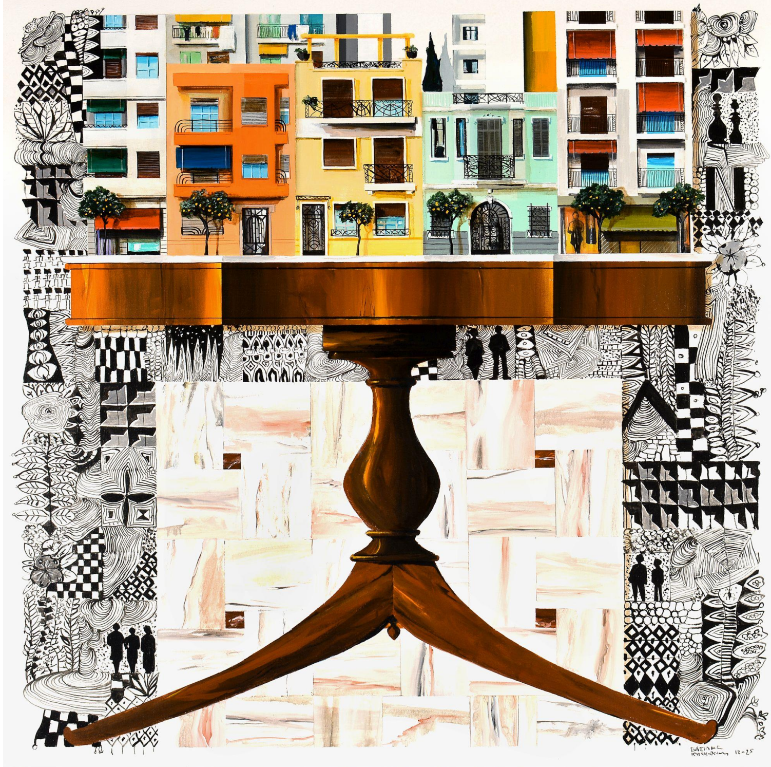
'Urban Tools II-No18-the bitter orange trees' 2025, 100X100cm. acrylic, gouache & oil on canvas