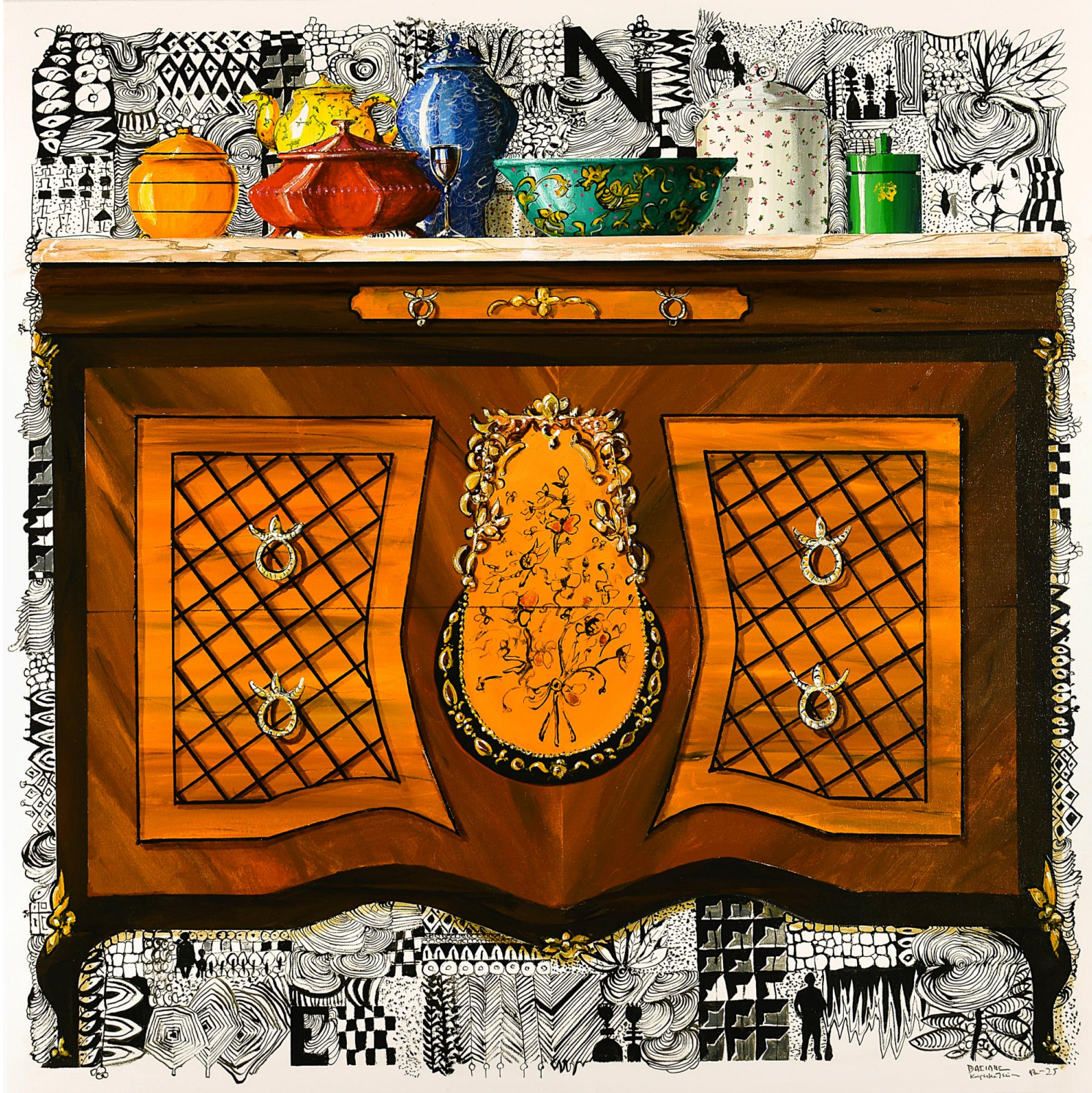
'Urban Tools II-No15-the little pound box' 2025, 100X100cm. acrylic & oil on canvas