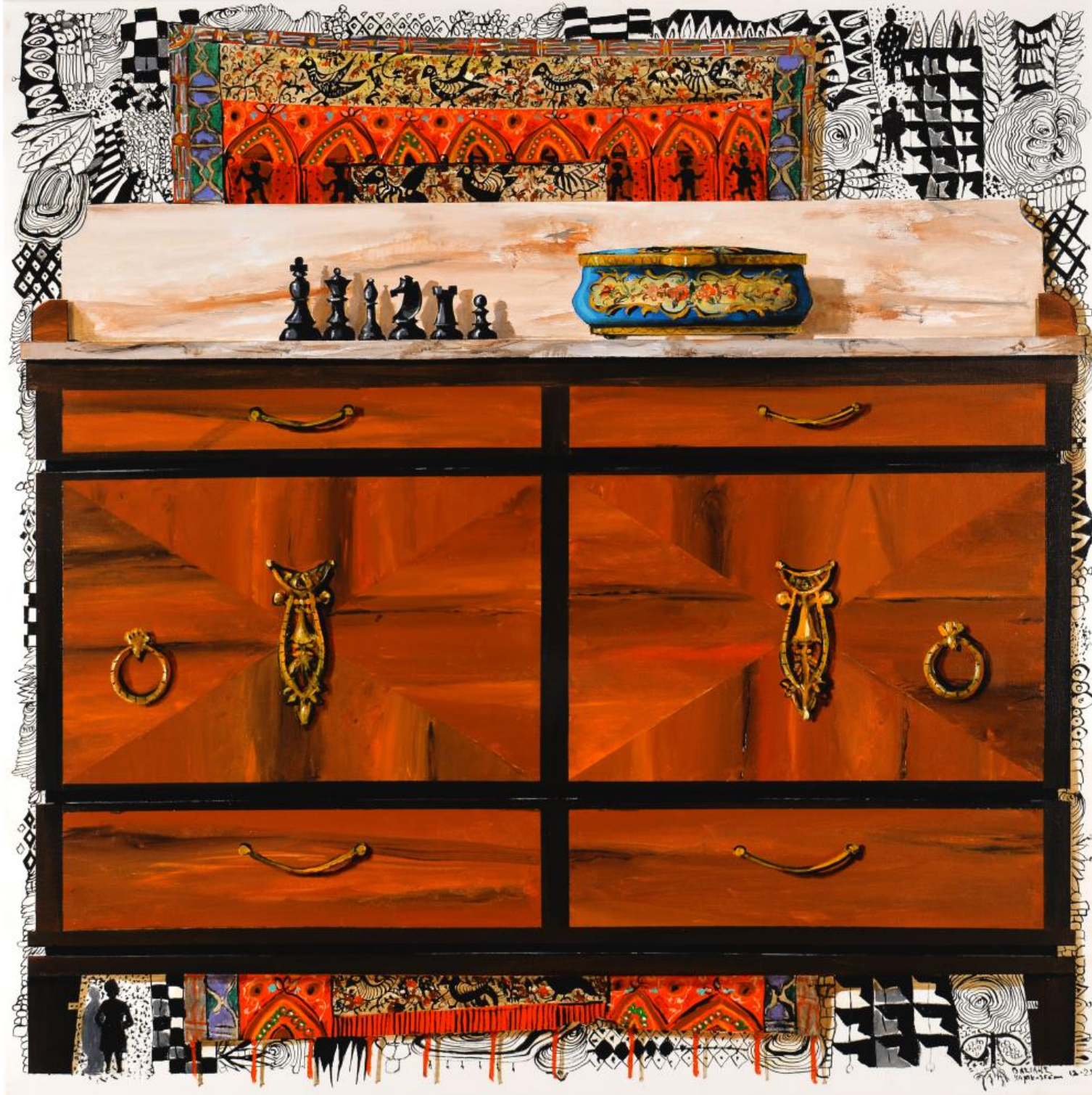
'Urban Tools II-No16-the army' 2025, 100X100cm. acrylic, gouache & oil on canvas