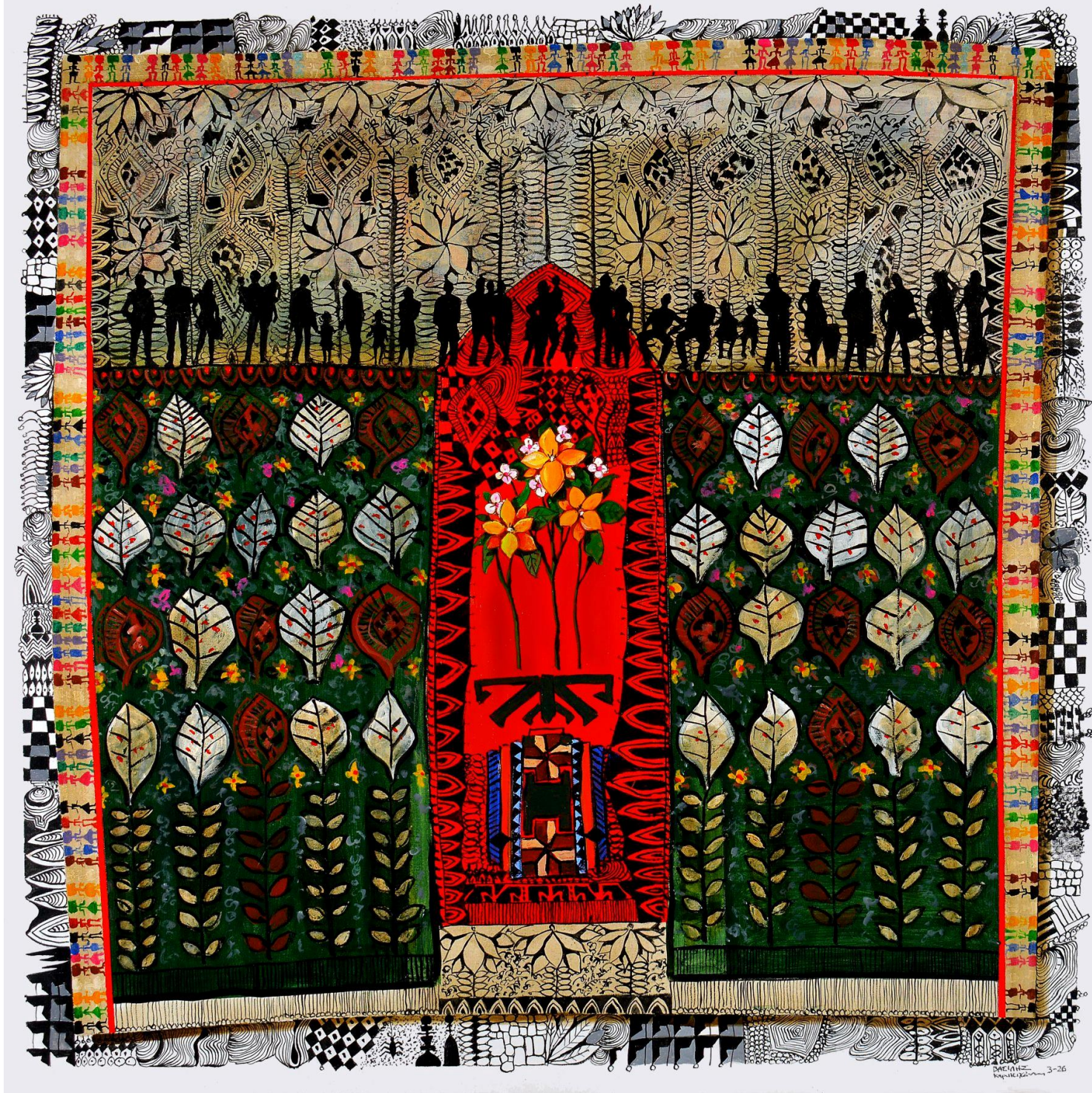
'Urban Tools II-No26-Sunday in the park' 2026, 100X100cm. acrylic, gouache & oil on canvas