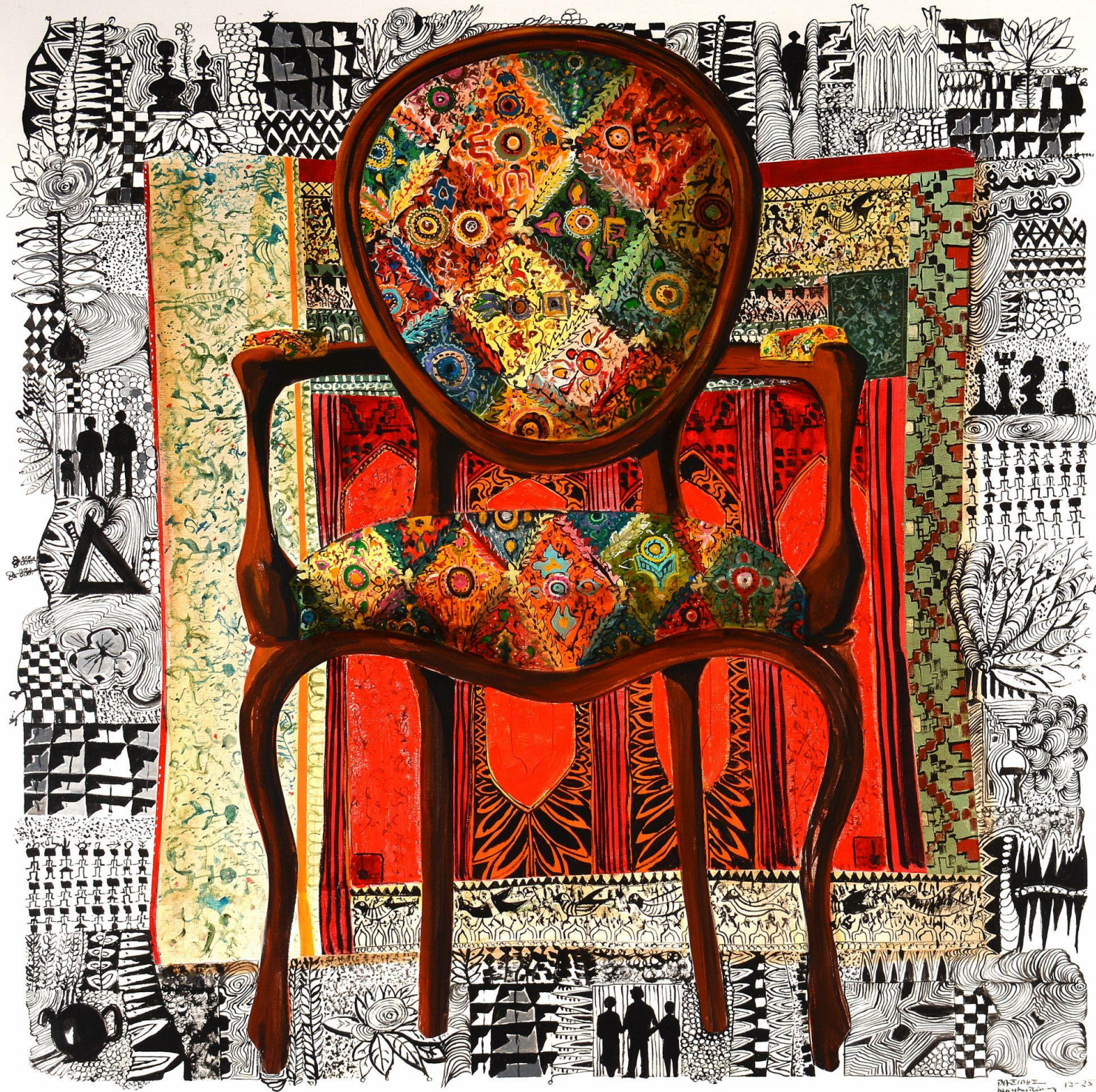
'Urban Tools II-No19-Damascus' 2025, 100X100cm. acrylic, gouache & oil on canvas