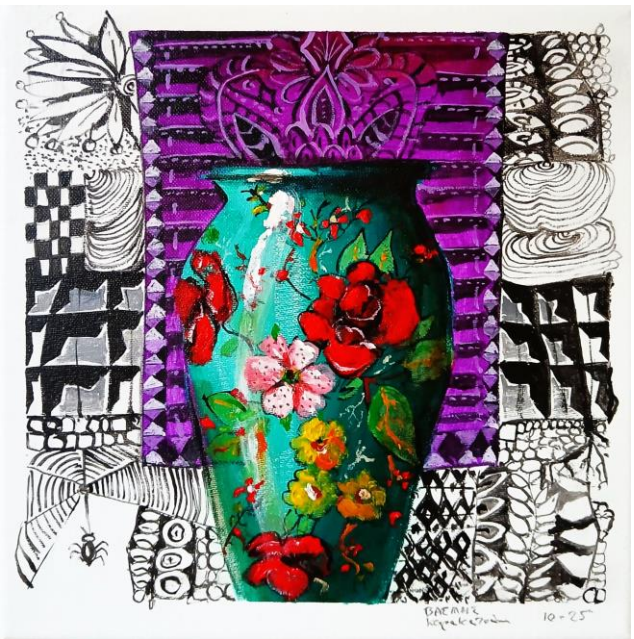
'Urban Tools II-No9' 2025, 30X30cm. acrylic, on canvas