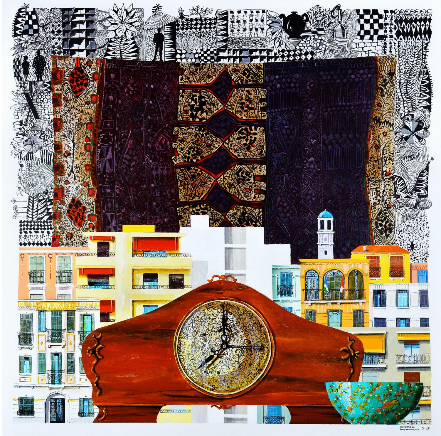
'Urban Tools II-No23-the time' 2026, 100X100cm. acrylic, gouache & oil on canvas