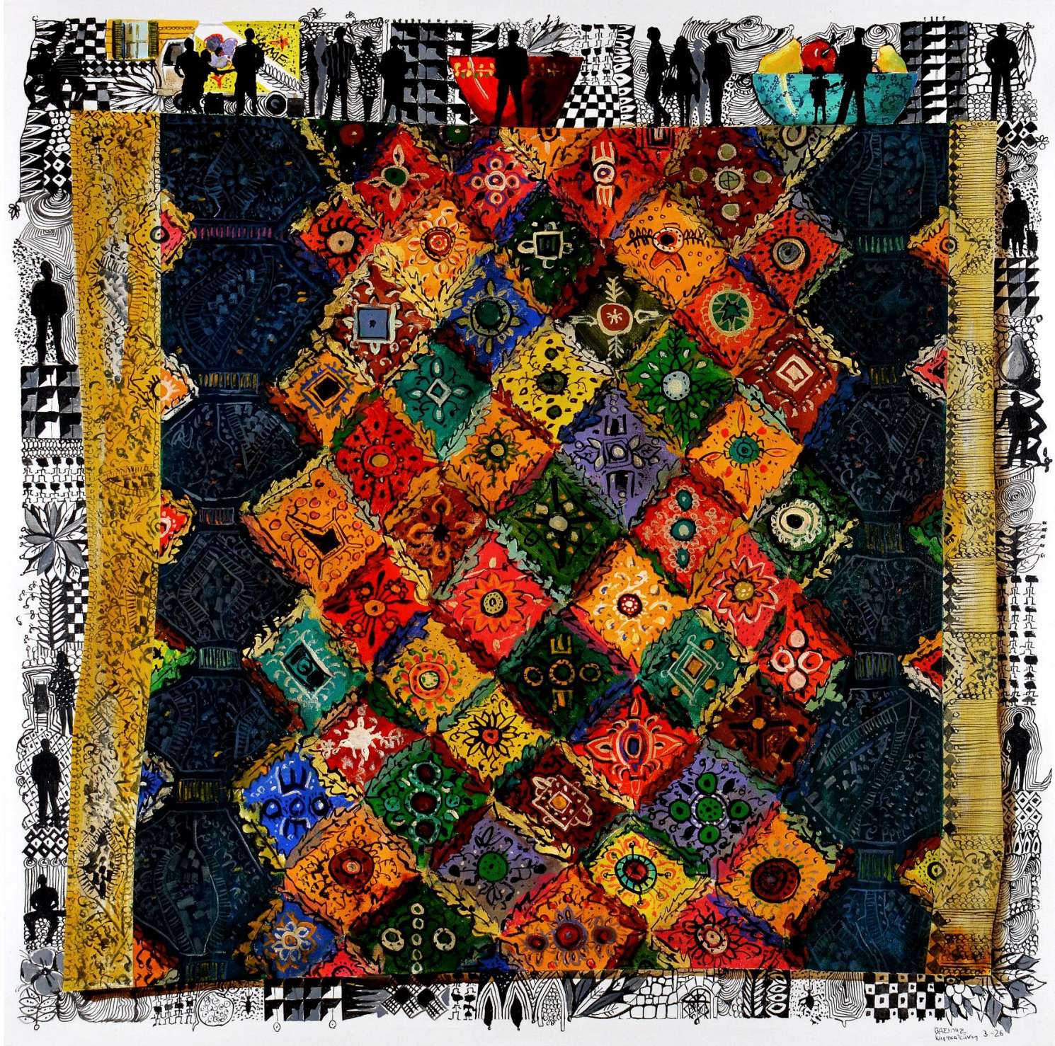
'Urban Tools II-No25-the market' 2026, 100X100cm. acrylic, gouache & oil on canvas