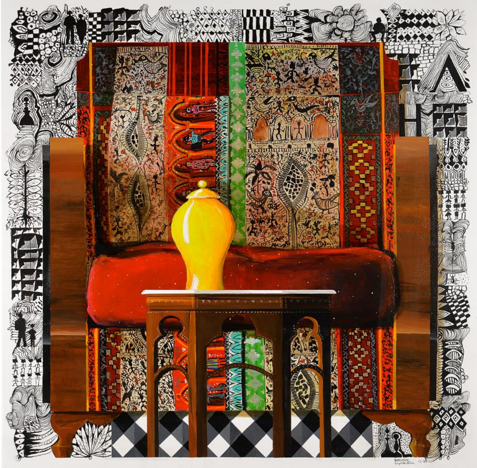
'Urban Tools II-No17-the magician's throne' 2025, 100X100cm. acrylic, gouache & oil on canvas