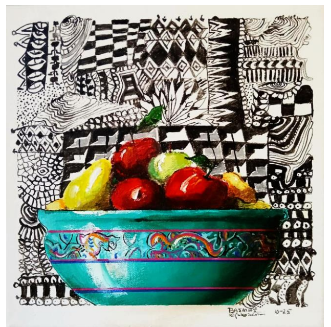
'Urban Tools II-No10' 2025, 30X30cm. acrylic, on canvas