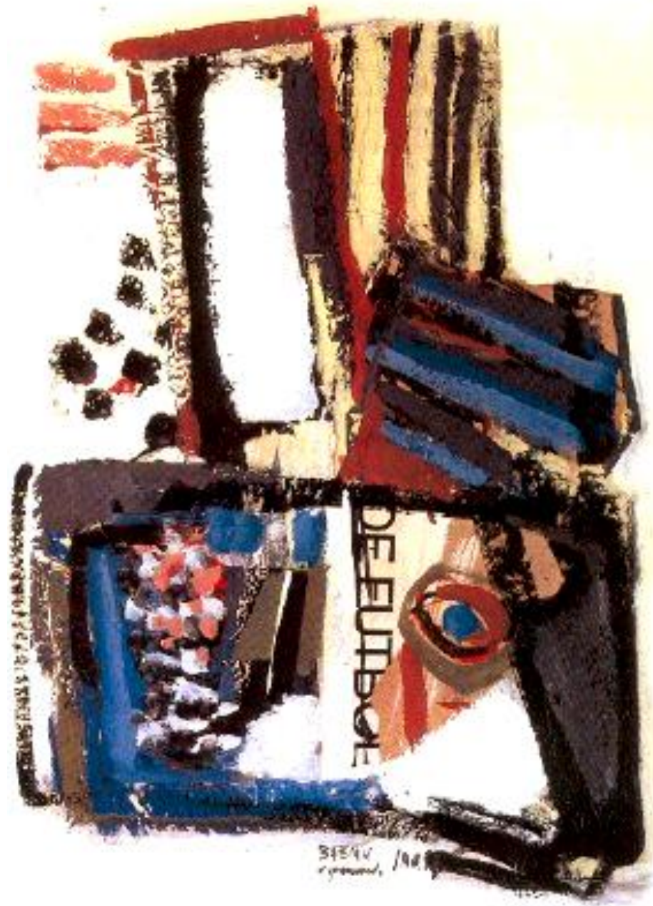
'Imprints', 1987 mixed media on canvas 070X060 cm. private collection, Athens, Greece