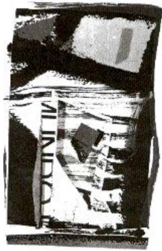
'Imprints', 1987 mixed media on paper 035X015 cm. private collection, Athens, Greece 'Imprints', 1987 mixed media on paper 035X025 cm. private collection, Athens, Greece