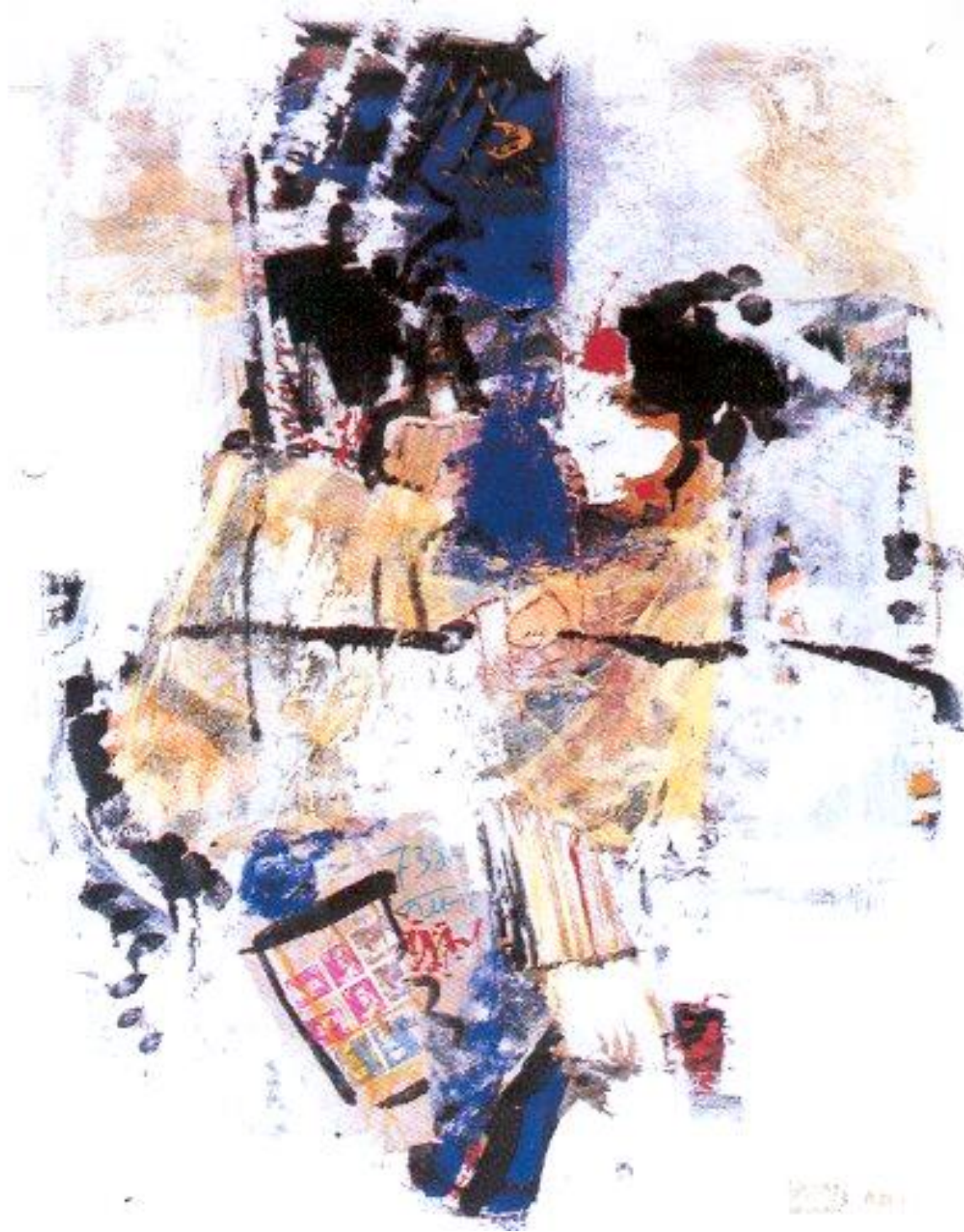
'Imprints', 1987 mixed media on canvas 091X073 cm. private collection, Athens, Greece